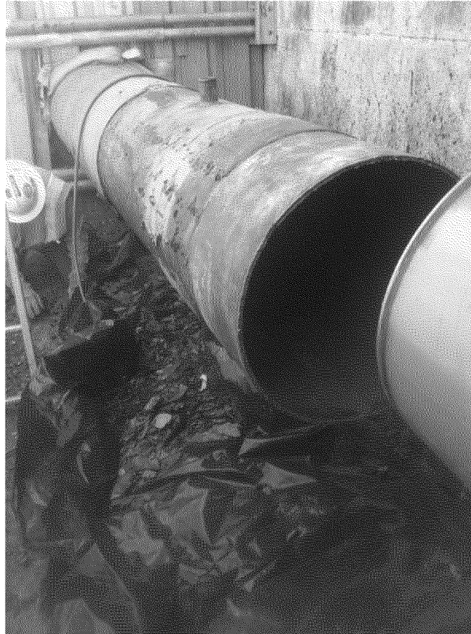
5 6 7 8 9 10 11 12 13 14 15 16 17 18 19 20 21 Illustration C: Coating Deficiencies

1 Illustration C, called “Coating Deficiencies,” is a photograph of a PG&E pipeline segment in 2 Antioch. The pipe had been cut for hydro-static testing. The photo shows that between the worker’s 3 shoulder and the open end of the pipeline, there is extensive pitting in the pipe coating on the pipe, and 4 the coating is cracked and not bonded well.