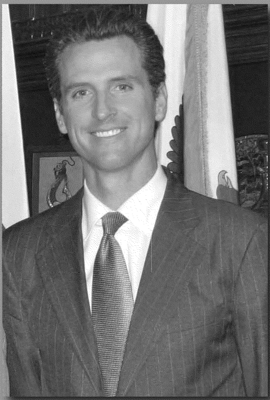
Keynote Speaker & Moderator