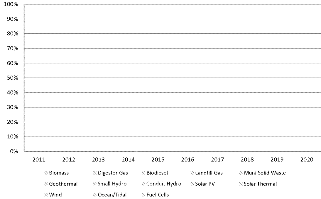
Resource Mix Per Year