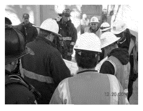
Training First Responders

PG&E conducts annual electric safety training for first responders; including law enforcement agencies, fire departments, public works and transportation agencies.