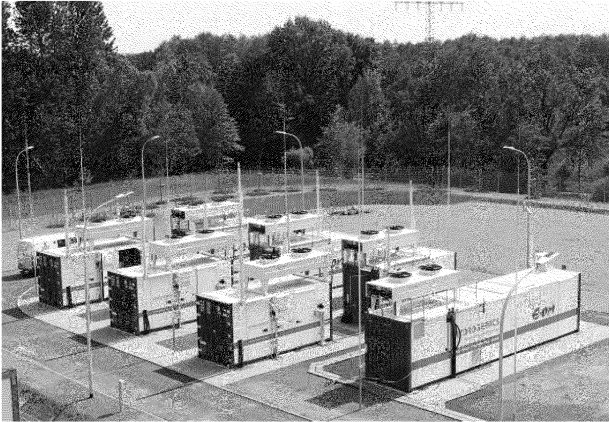
Exhibit 5 – Operating Hydrogen Energy Storage (Power-to-Gas) Facility in Falkenhagen, Germany