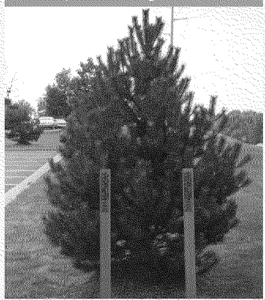
Example of incompatible vegetation planted within the ROW.