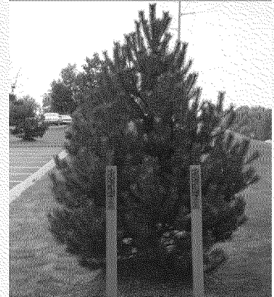
Example of incompatible vegetation planted within the ROW.