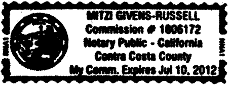
Place Notary Seal Above