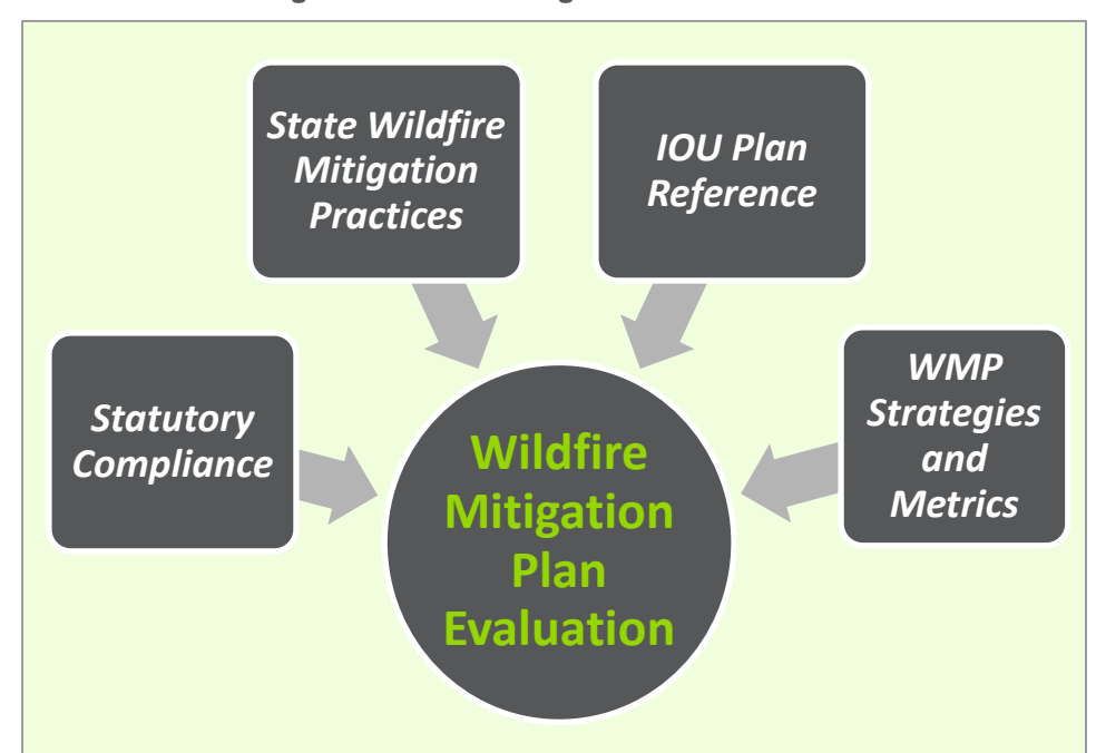
Figure 2: Contributing Factors to Evaluate the Plan

Figure 2 represents the attributes comprising the methodology and approach of the evaluation.