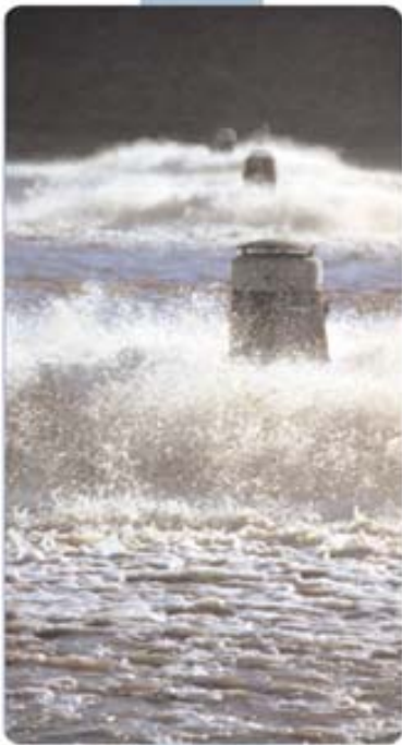
Aeration pond at the City of Riverbank wastewater facility. The Central Valley city, population 16,000, will save a projected $20,000 annually in energy costs through process improvements fully funded by the California Process Optimization Program.

Lower Operating Costs, Stable Treatment Process with Energy-Efficiency Improvements