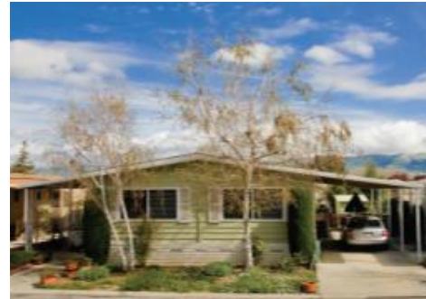
PG&E's Direct Install for Manufactured and Mobile Homes offers hard-to-reach customers low-cost options to save energy and lower their energy bills.

The Direct Install for Manufactured and Mobile Homes subprogram is a direct installation, no-cost-to-the-customer subprogram that serves the hard-to-reach residents of manufactured homes and mobile home parks. It also targets a variety of non-English speaking customers. The subprogram improves the efficiency of air conditioners by providing air conditioning tune-up and refrigerant charge adjustment, fan controls to save energy by running the fan at the end of the compressor cycle, and high-efficiency blower motor upgrades. The subprogram also offers installation of Tier II Smart Power Strips and ENERGY STAR® rated products including lighting, low flow showerheads, and aerators.