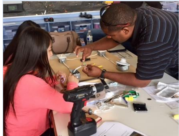
High School Green Technology Instructor teaches students proper electrical wiring techniques.

Training includes hands-on training that fulfills Career and Technical Education (CTE) standards and includes providing students experience building circuits, solar systems, and wind turbines, while helping students meet UC admissions requirements.