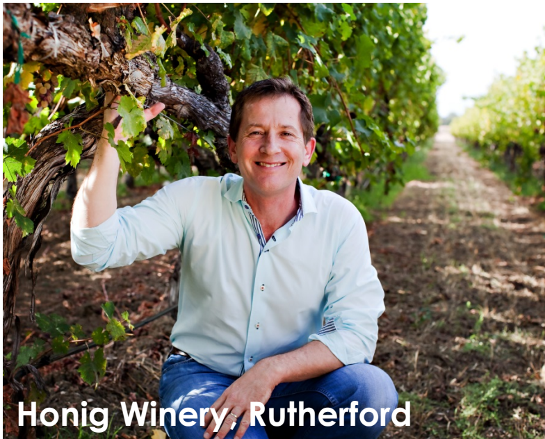
Honig Winery, Rutherford