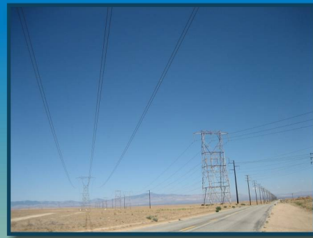
Segment 4 in NW Antelope Valley