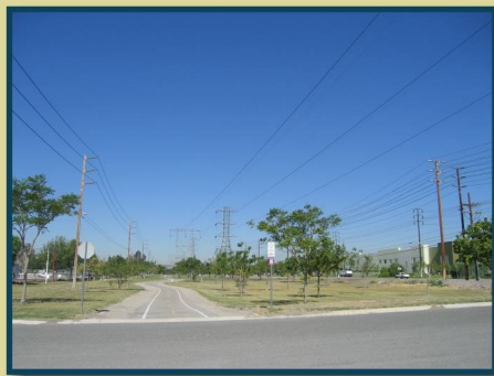
Segment 8 in Chino