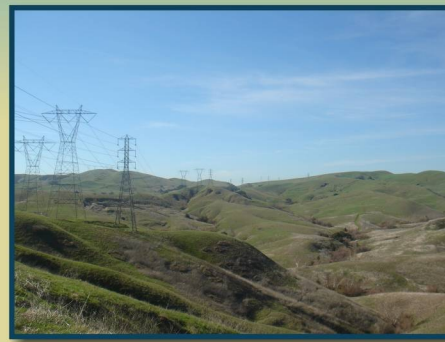
Chino Hills State Park