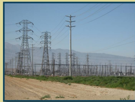
Mira Loma Substation