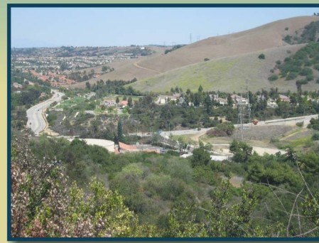
Segment 8 in Rowland Heights