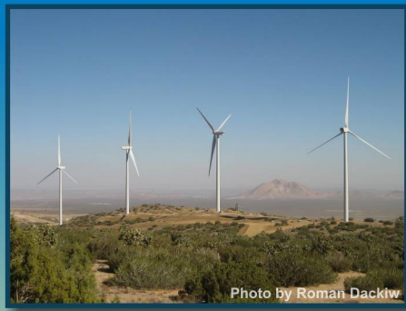
Tehachapi Wind Turbines