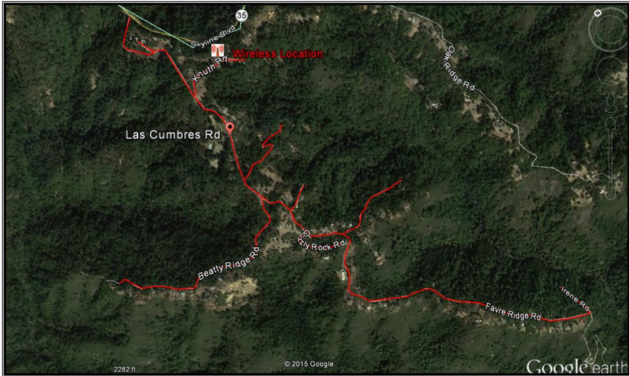
Figure 2: Map of Project with Route Detail

The project is located in a remote area in the Santa Cruz Mountains above Los Gatos. This has traditionally been an underserved area due to the difficulty of the terrain and the excessively high cost of providing wireline services.