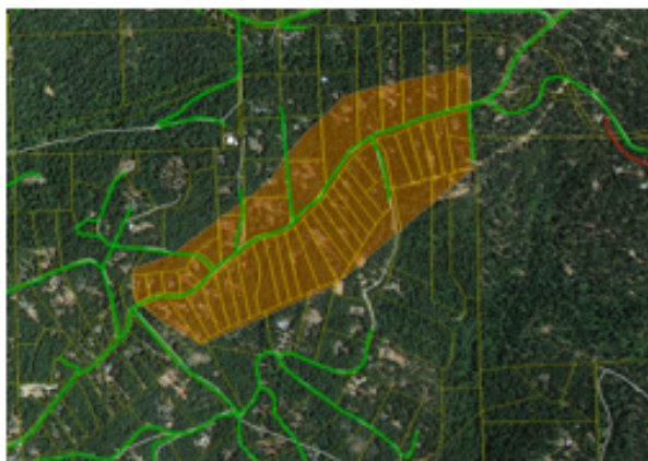
Banner Mountain South Community Nevada City, CA 95959