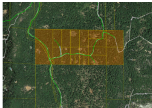
Buckeye Rd Community Nevada City, CA 95959